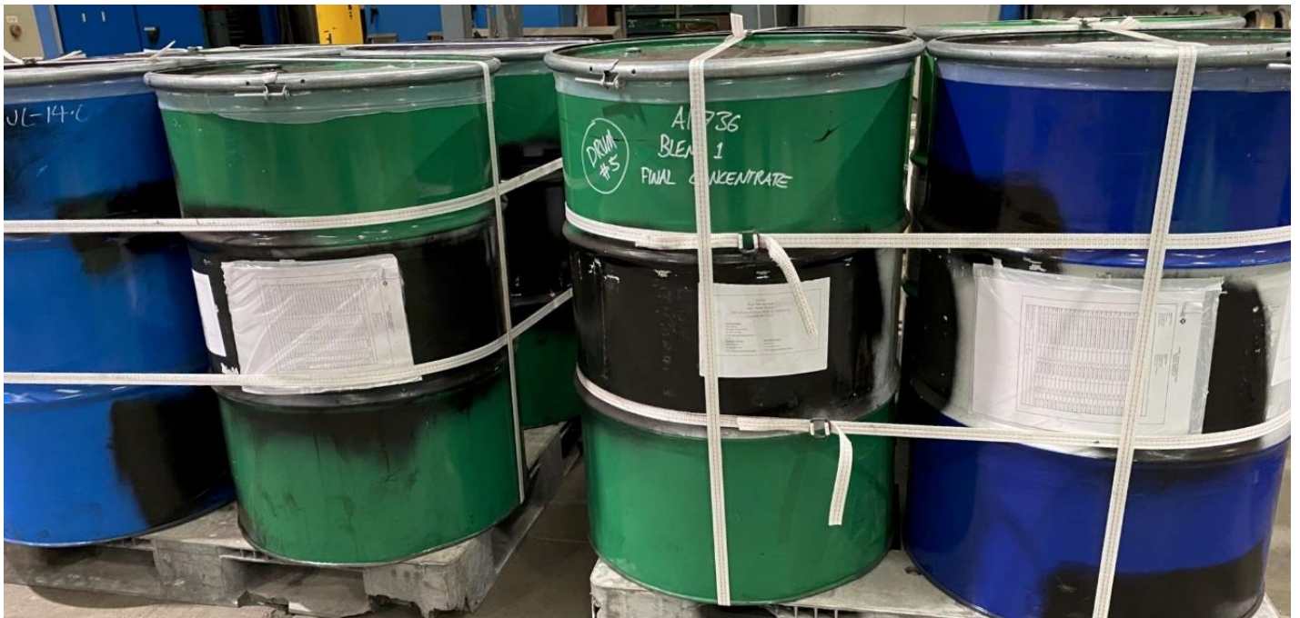
Two-tonne sample of beneficiation circuit concentrate shipped to the US for Grate Kiln pilot testing

Proactive Investors facilitate the largest global investor network across 4 continents in 4 languages. With a team of analysts, journalists & professional investors Proactive produce independent coverage on 1000's of companies across every sector for private investors, private client brokers, fund managers and international investor communities.