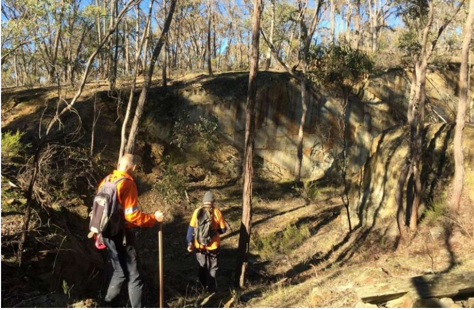
Fieldwork at historical workings on the Castlemaine project.