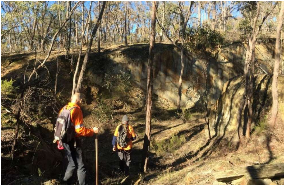
Fieldwork at historical workings on the Castlemaine project.