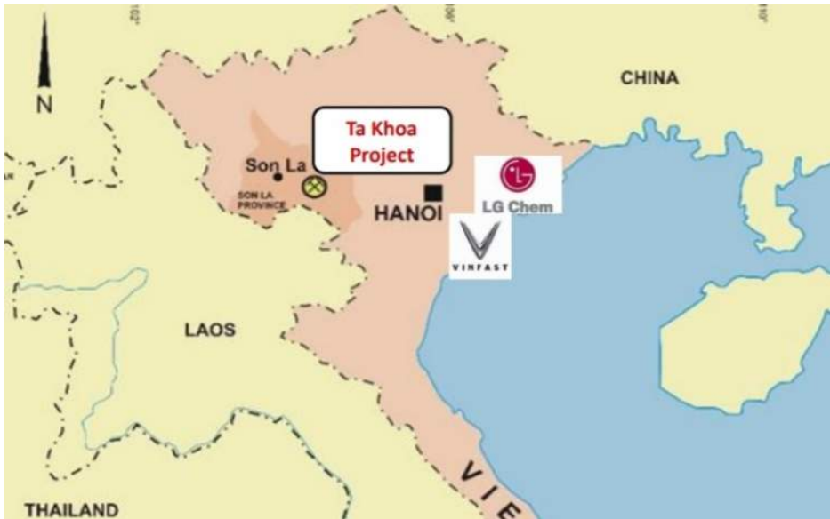
Ta Khoa project location in northern Vietnam.

This major zone continues north into China where it is associated with a series of comparable magmatic nickel-copper-PGE deposits such as Baimazhai, Qingquanshan, Limahe and Yangliuping.