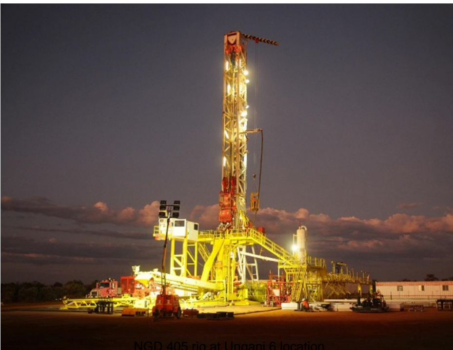
NGD 405 rig at Ungani 6 location

The Ungani 6 well surface is on Production Licence L20, 160 metres to the north of the Ungani 1 and 2 wellheads and immediately adjacent to the Ungani Production Facility.