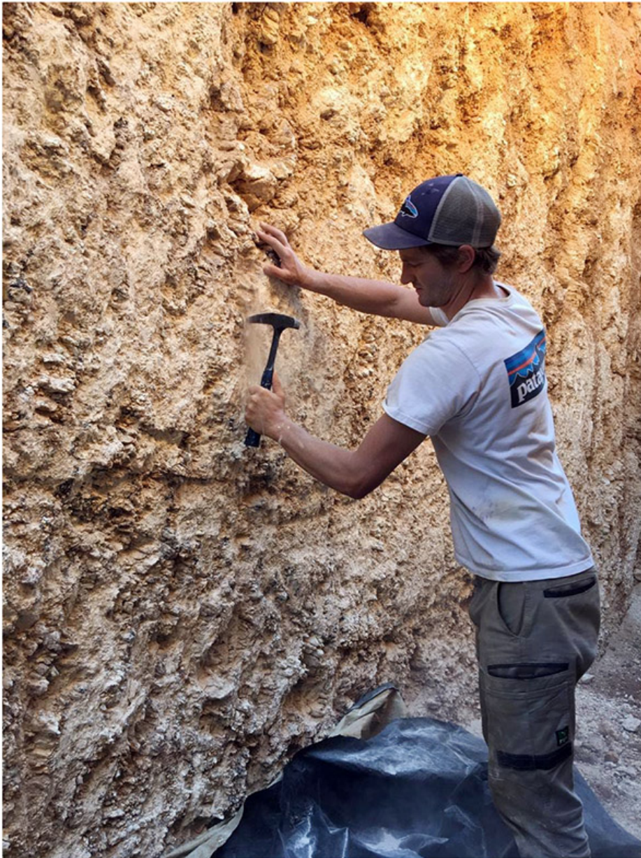
Sampling of pegmatite trenches.