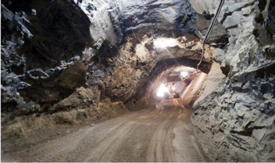
CBL underground spodumene mining operation.

CBL is mining spodumene pegmatites, producing a spodumene concentrate which is then transferred to a chemical plant in Divisa Alegre, Minas Gerais, where it is transformed into industrial-grade lithium hydroxide.